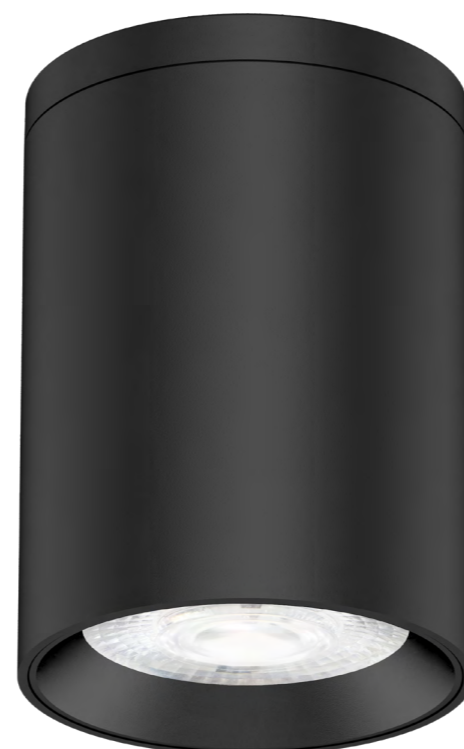
LED Downlight DL277A/B Series